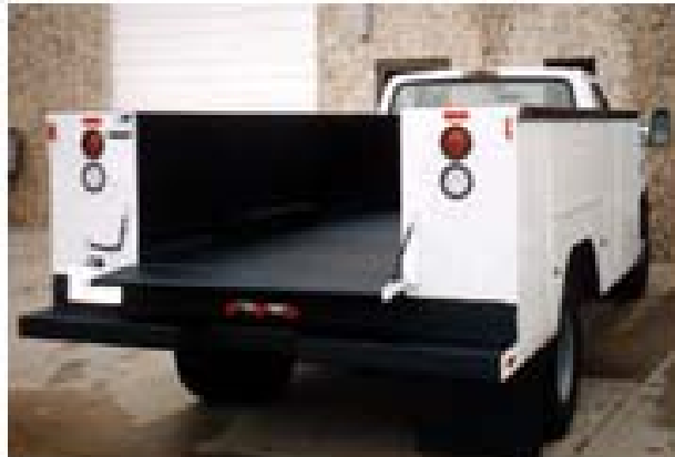
Perfect for Utility vehicles

"If you don't want it to rust bring it to us!"